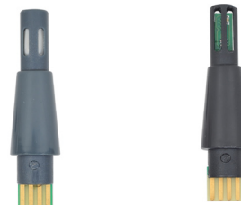
Hygrostick part number POL4750, for high moisture applications.