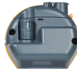
Quikstick ST POL8751, standard with all MMS2 kits and with the same performance as the standard Quikstick. A Quikstick ST can remain connected to the MMS 2 while using the pins.

The MMS Plus may be used with three styles of interchangeable humidity probe, the Hygrostick, the Quikstick and the Quikstick ST. The Hygrostick (grey POL4750) can be used for high moisture applications such as concrete measurement. Quikstick (black POL8750) is a general purpose, fast-responding full range sensor.